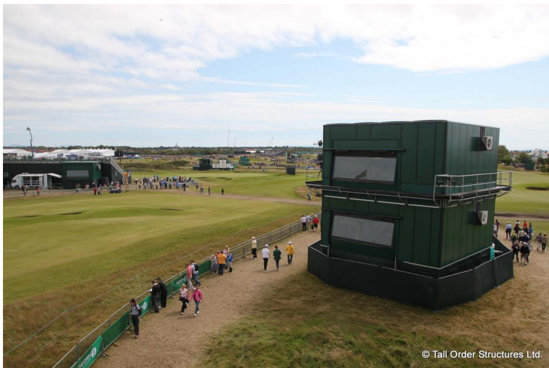
Studio structures at Royal Lyham 2012.